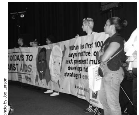
Protestors at the Conference challenging presidential candidates to establish a national HIV/AIDS strategy in the first 100 days.

Does low-viral load reduce the risk of HIV transmission? Earlier this year, the Swiss Federal Commission on HIV/AIDS raised a controversy by suggesting sex without condoms may pose no realistic risk of HIV transmission from individuals with an undetectable viral load and no sexually-transmitted infections. At AIDS 2008, a multi-study analysis involving 5,161 heterosexual couples could neither confirm nor refute the Swiss estimate that HIV transmission per sex act falls below 1 in 100,000 for a person with an undetectable viral load (compared to an estimated rate of 1 in 30,000 for a person using condoms).