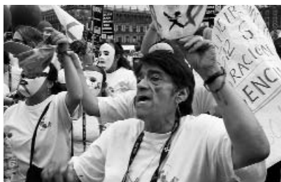
People marching for Universal Action NOW (the theme of the Conference) in Mexico City, August 3.

I had the wonderful opportunity to attend the XVII International AIDS Conference in August. With over 25,000 participants from more than 170 countries, it was an amazing experience! Please see page 3 for some of the highlights from the conference. We plan to hold an update seminar sometime in the next few weeks — we will post the date on our website.