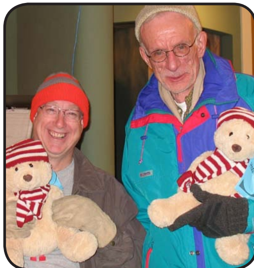
Volunteers take home a teddy for all their volunteer work!